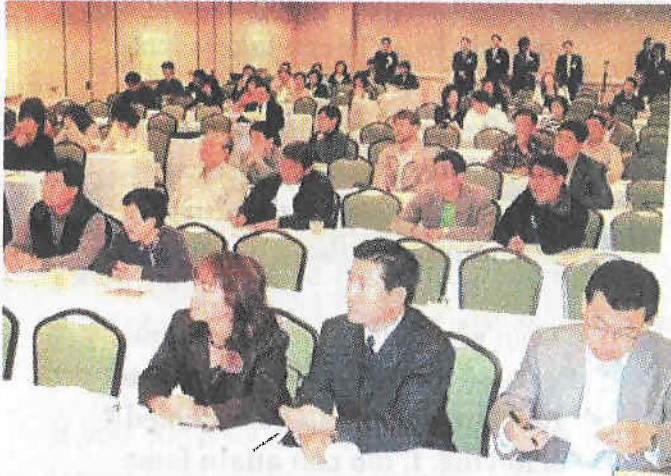
1st Community Law School.